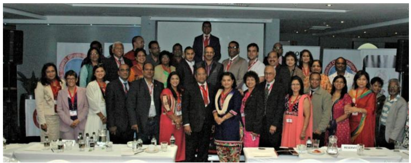
Photo above: Some of the participants after pose for a photo after the concluding session.