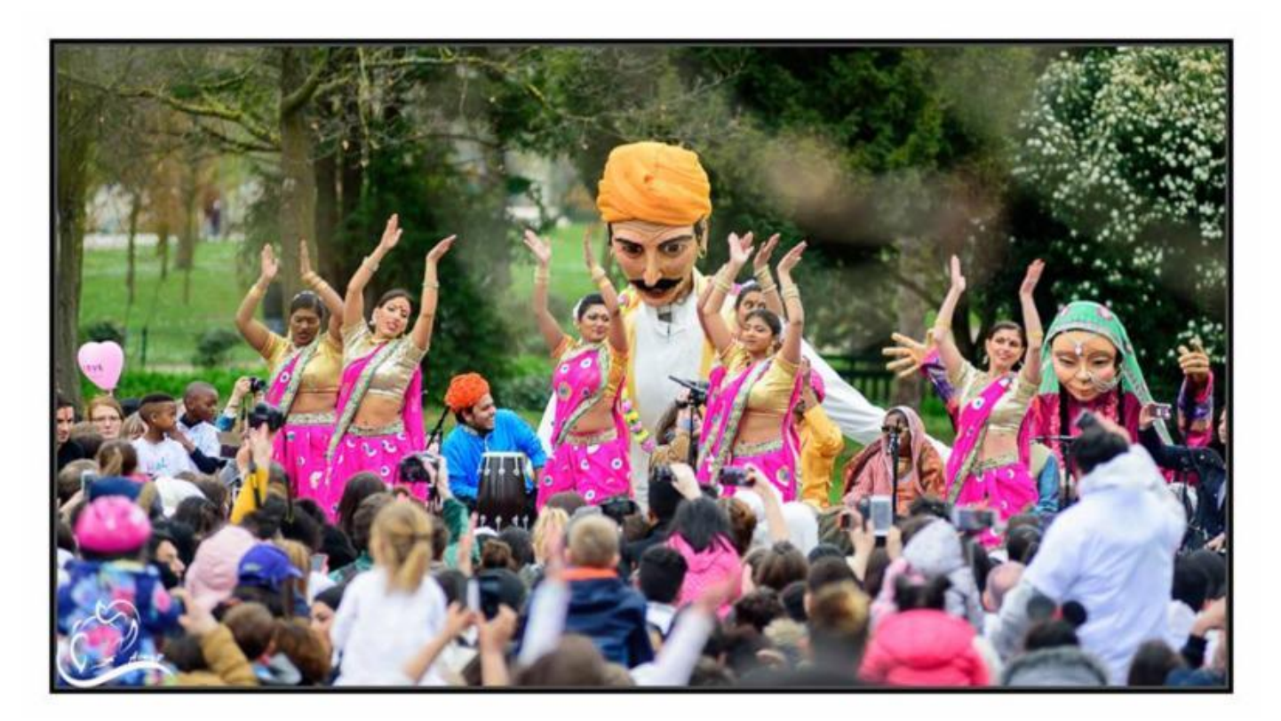
Photo above: Dancers at the Holi Festival 2017

Around 25000 visitors, French and Indian origins shared this great moment of happiness with colors in a spirit of love, friendship and brotherhood. Many people got a good glimpse of the rich and diverse cultures of India.