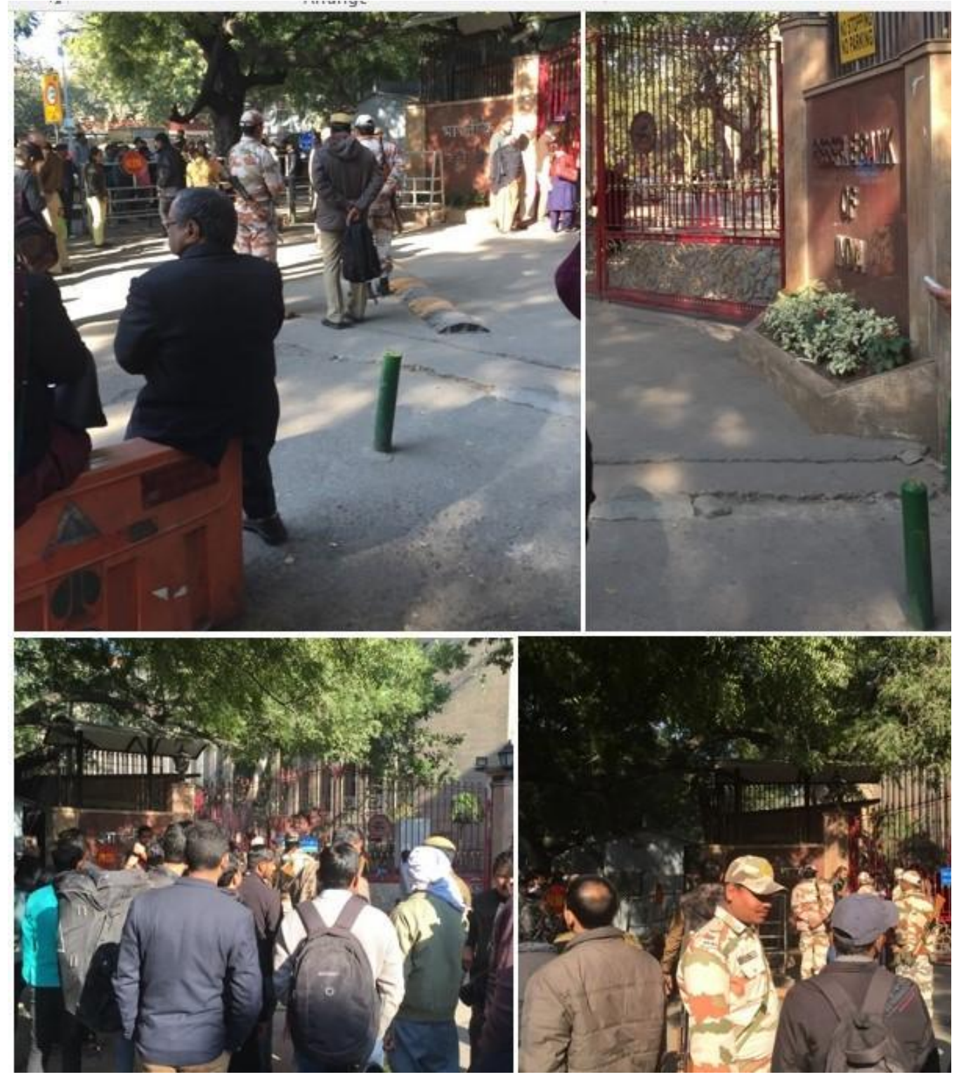
Photo above: People standing at the RBI Gate in New Delhi on January 10th, 2017