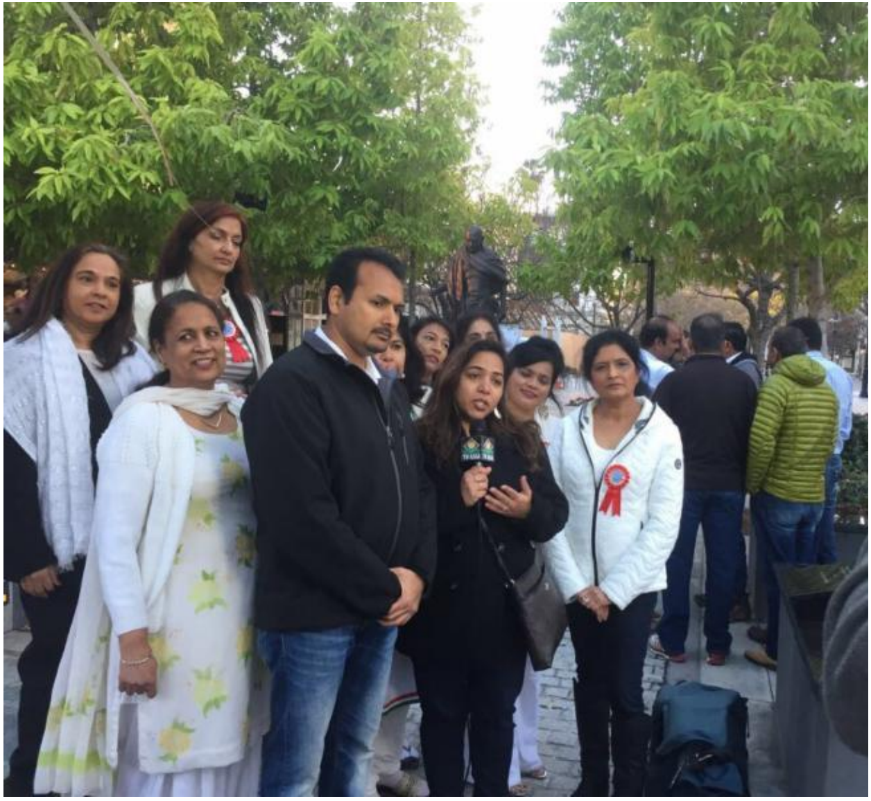
Photo above: Candlelight Vigil by GOPIO Inland Empire Chapter, California.