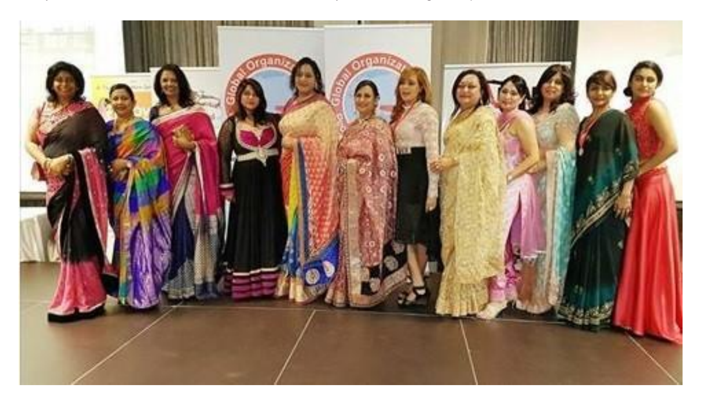
Photo above: Indian Ladies at the Finale Awards Banquet of GOPIO-Durban Business Summit

The Gala dinner was a display of warmth, love and hospitality of the South African Indians. It seems the clock may have stopped for them, 3-4 generations ago when their ancestors landed in Durban as indentured labor on a ship. Today the success and their achievement is noteworthy and something to be proud of.