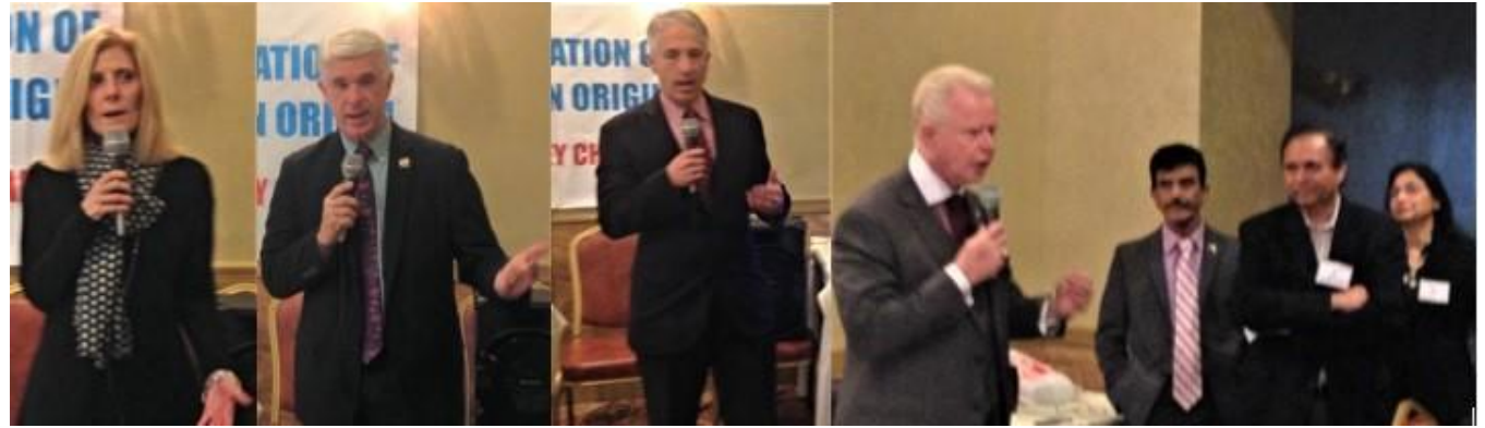
Photo above: American Political with GOPIO officials at the seminar

The event was attended by over 60 people and even though was two days before the crucial Gubernatorial and State Senate and Assembly elections, the attendance included the Deputy Speaker of the NJ State Assembly, a Senator, an Assemblyman and numerous other elected New Jersey officials.