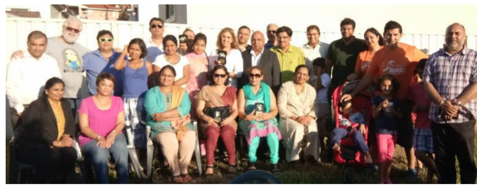
Photo above: GOPIO-Sydney members present at the check presentation to Indian Support Centre (ISC)