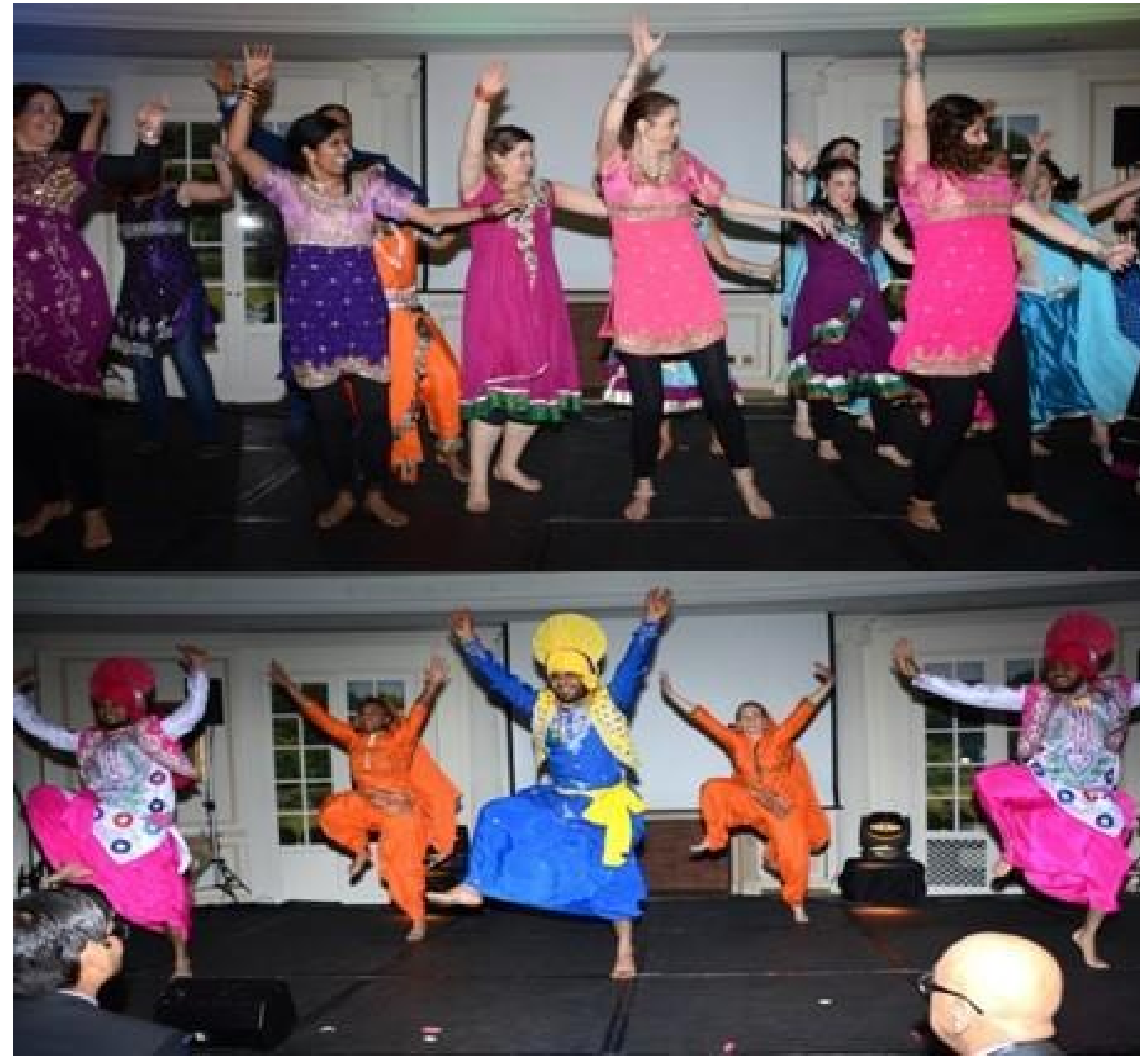
Photo top: Cultural program in the evening-Bollywood dance by French team, Photo bottom: Punjabi Bhangra dance