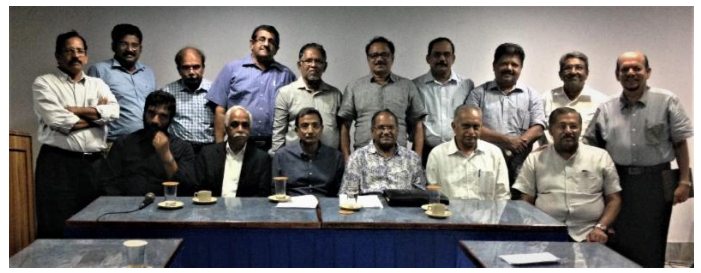
Photo above: GOPIO-Kochi officials with speakers at the meeting on August 21st