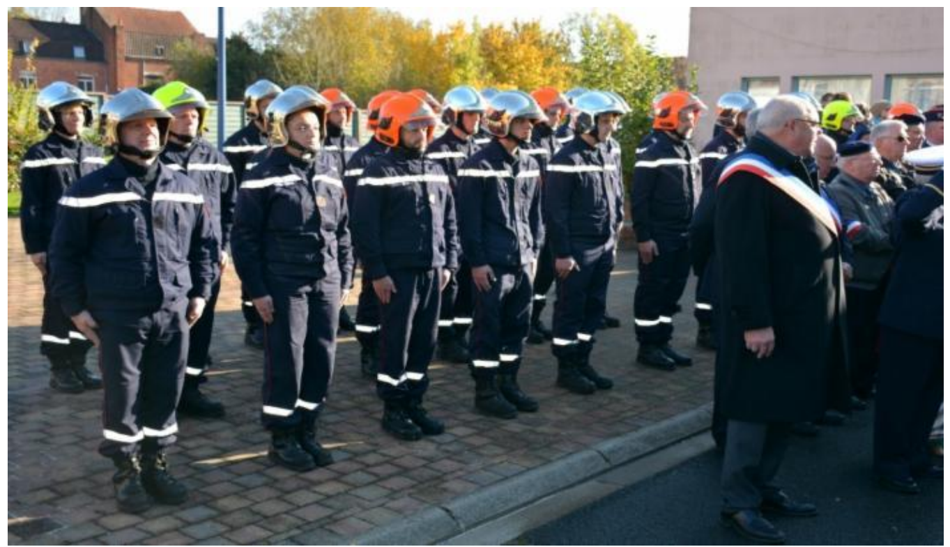
Photo: French fire force team, and former military members along with the Mayor at GOPIO program at Neuve Chappelle

At the site of Neuve Chapelle (Richebourg), there now stands a memorial garden, circled by domed pavilions and towering columns. It now forms a permanent reminder of the sacrifice of the soldiers of Indian origin, our forefathers.